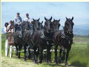
Simpson Percherons at Rush Ranch Days