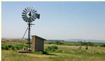
Rush Ranch, Solano Land Trust

Each month we offer recreational carriage driving events at Solano Land Trust and Muir Heritage Land Trust Properties