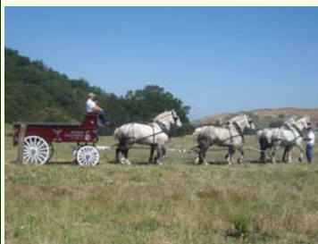
Simpson Percherons at Fernandez Ranch Celebration

When John Muir first arrived in California by ship, he was bewildered and overwhelmed by the raucous energy of San Francisco in 1869. He asked a passerby the quickest way out of the city. "Well where do you want to go?" the stranger inquired. "Anywhere Wild!" exclaimed Muir