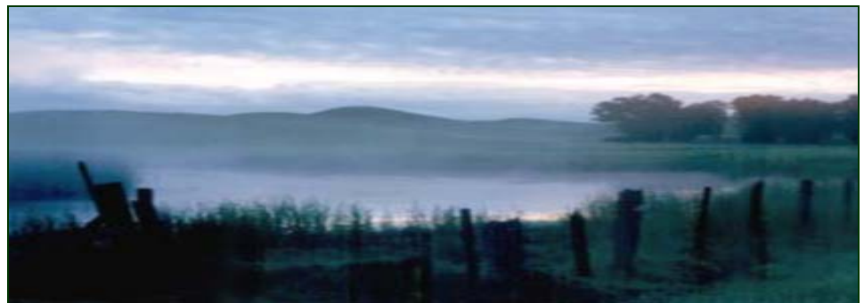
Rush Ranch, Solano Land Trust

Wish List: Stock trailer (tall), Events Coordinator, Volunteers (all ages, all skills), building materials, horse feed and supplies